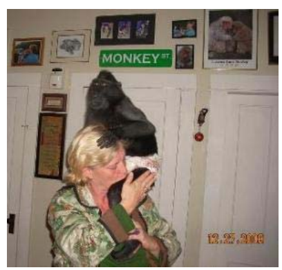
Celebes crested macaque