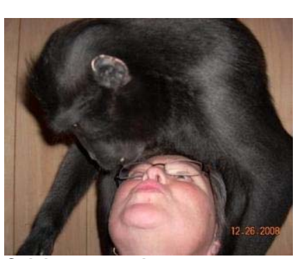
Celebes crested macaque