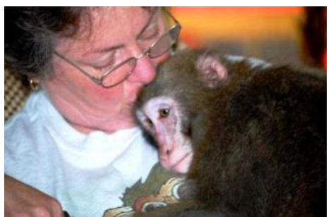
Japanese snow macaque