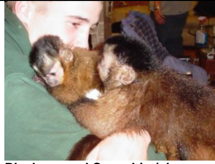
Black-capped Capuchin (above and on the left)