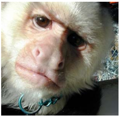
Black and White Capuchin