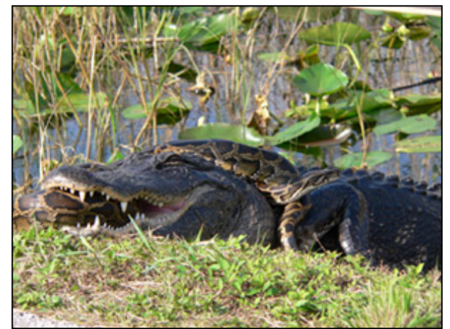
An American alligator and a Burmese python locked in a struggle to prevail in Everglades National Park. This python appears to be losing, but snakes in similar situations have apparently escaped unharmed, and in other situations pythons have eaten alligators.

have since been discovered in Big Cypress National Preserve to the north, Miami's water management areas to the northeast, Key Largo to the southeast, and many state parks, municipalities, and public and private lands in the region.