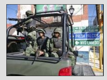
Ciudad Mier, virtual ghost town