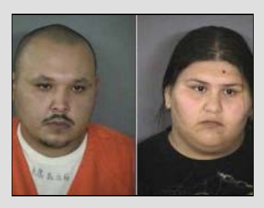
Man gets 40-year prison term