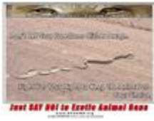
Freedom venomous snake