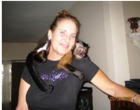
Black-capped Capuchin (above and on the left)