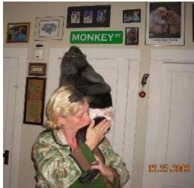
Celebes crested macaque