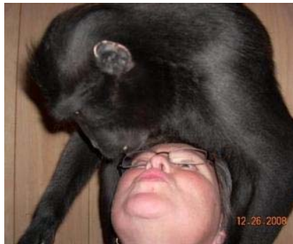
Celebes crested macaque