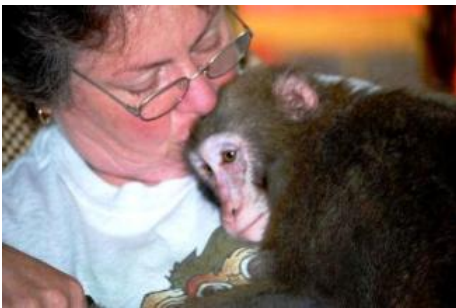
Japanese snow macaque