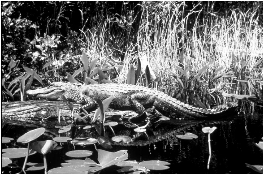
Figure 2. Alligator mississippiensis photograph courtesy of the United States Fish and Wildlife Service. Available at http://images.fws.gov .

Reports of alligator bites from previous surveys 9,10 were also evaluated for additional cases of bites or attacks that current state officials may not be aware of, for different personnel may currently be responsible for alligator complaints.